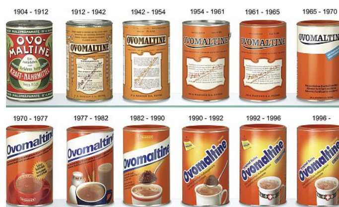
Ovomaltine in its typical orange cans through the years.

Before and after this merger, Ovomaltine had its own success story. In 1904 it was launched as a medical or dietetic preparation and only in 1922 free sale as a general food item was accepted. The image changed rapidly and Ovaltine became and still is one of the most popular sports drinks. Today, Ovomaltine in various forms is the leading product of Wander Ltd., a subsidiary of Associated British Foods, with headquarter and production site in Neueneegg near Bern.