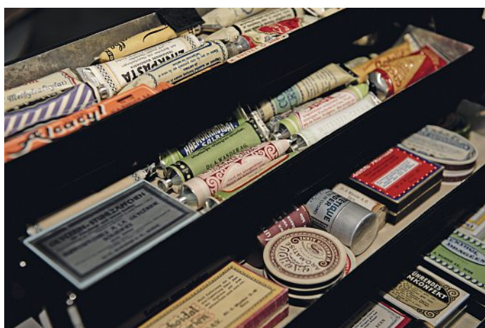
An old sample box of Wander pharmaceuticals was exhibited at the «Chemical Landmark» celebration.

Georg Wander could base a further step in manufacturing concentrated malt extract on an important result of research of the early 19 th century in thermodynamics. While he gained the initial malt extract by the classic method of beer brewing according to old brewers' tradition, the subsequent concentration of the extract to concentrated syrup had to be carried out under vacuum. Boiling at atmospheric pressure, i.e. at 100 °C and higher would cause heat damage and loss of quality of the syrup. The vacuum evaporator was developed in 1812 by the British chemist Charles Howard (1774–1816) for the concentration of raw sugar solution and the subsequent crystallization. By this invention, it became possible at an early stage in the industrial period to concentrate liquid food, in particular milk, with a very mild process.